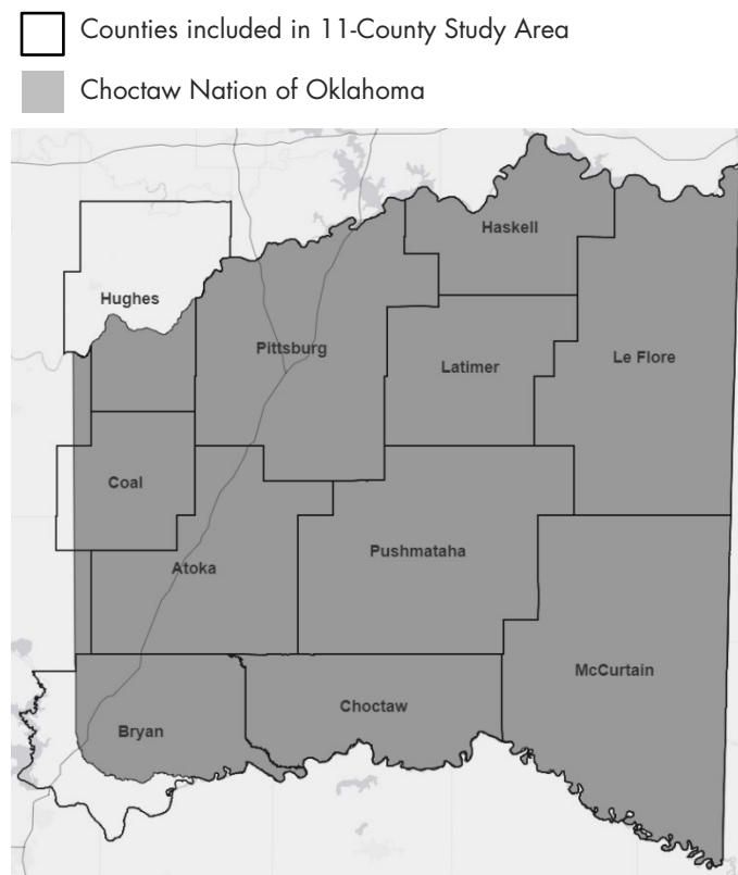
FIGURE 1. COMPARISON OF 11-COUNTY AREA AND CHOCTAW NATION