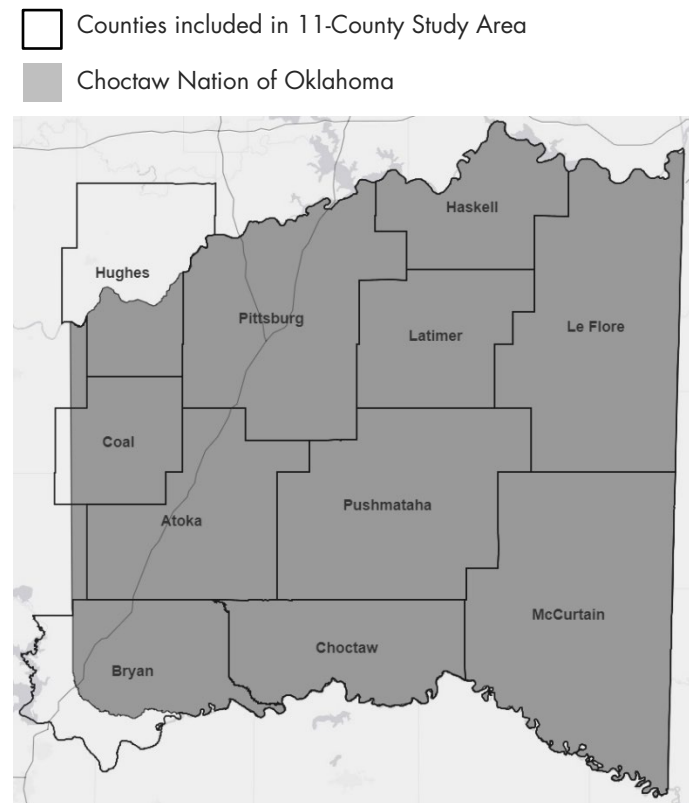
FIGURE 1. COMPARISON OF 11-COUNTY AREA AND CHOCTAW NATION